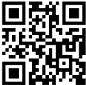
DSC website link for additional event photos