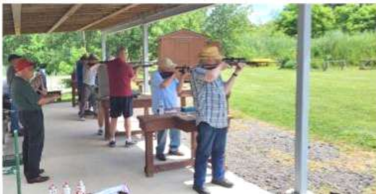
Plaid & Khaki

Any Pistol Caliber Firearm Pistol or Rifle from .22 to .45. Lead Bullets